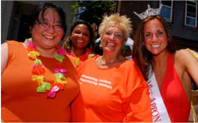
Jul 10: Cape Verdean Recognition Day Parade