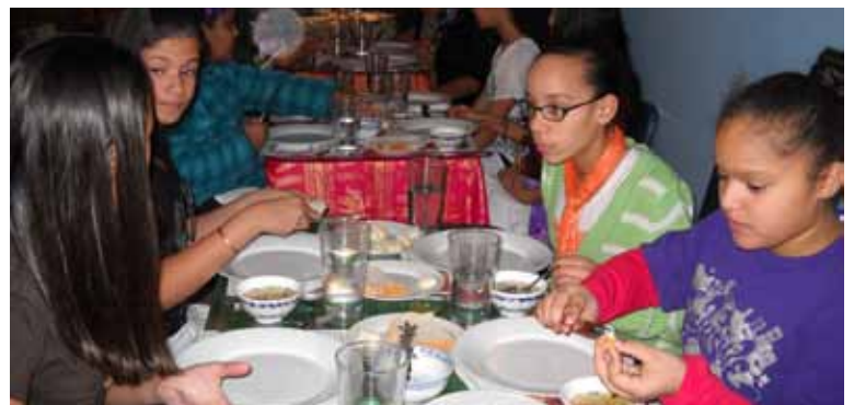
Mar 11: Girls Exclusive Etiquette Dinner