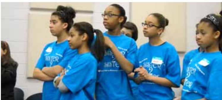
Mar 11: Sister 2 Sister Conference