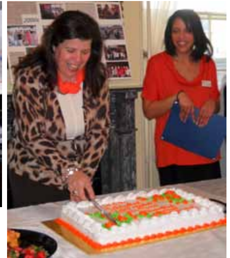
Apr 11: Our 100th Birthday!