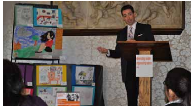
Oct 10: Week Without Violence