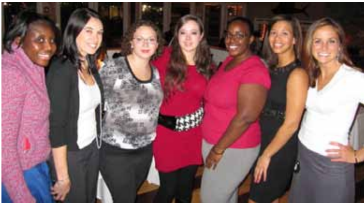
Nov 10: Leading Ladies - Be Social