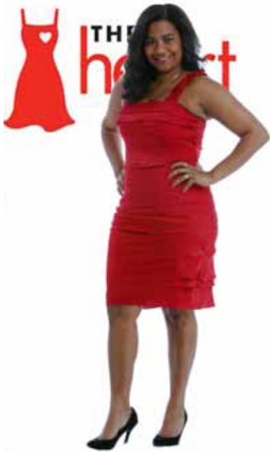
Feb 11: Red Dress Fashion Show & Silent Auction