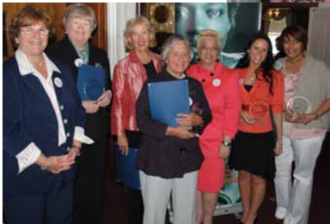
May 11: Women of Distinction Awards