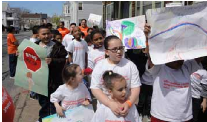
Apr 11: YWkids Stand Against Racism