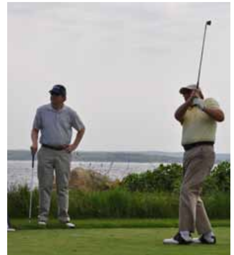
May 11: 100th Anniversary Golf Tournament