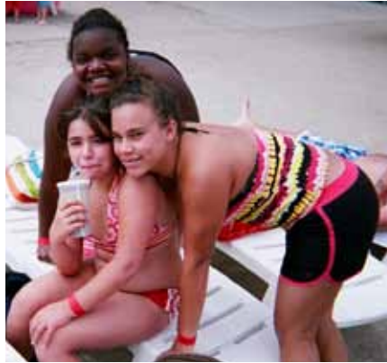
Aug 10: Girls Giving & Growing - Water Wizz / YWkids - BaySox