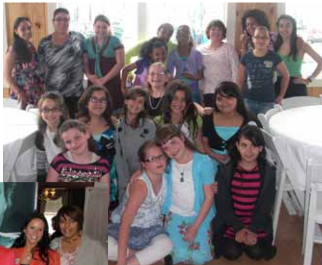
May 11: Tween 2 Teen