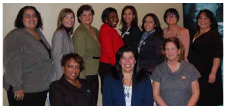
Nov 10: 99th Annual Meeting