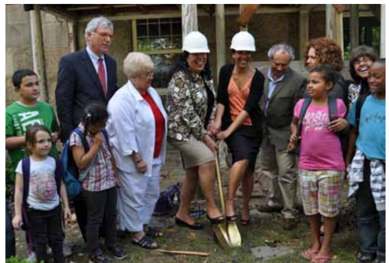
Jun 11: Groundbreaking for the East Portico