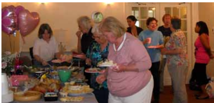
May 11: ENCORE plus Waterpals 10 Year Anniversary