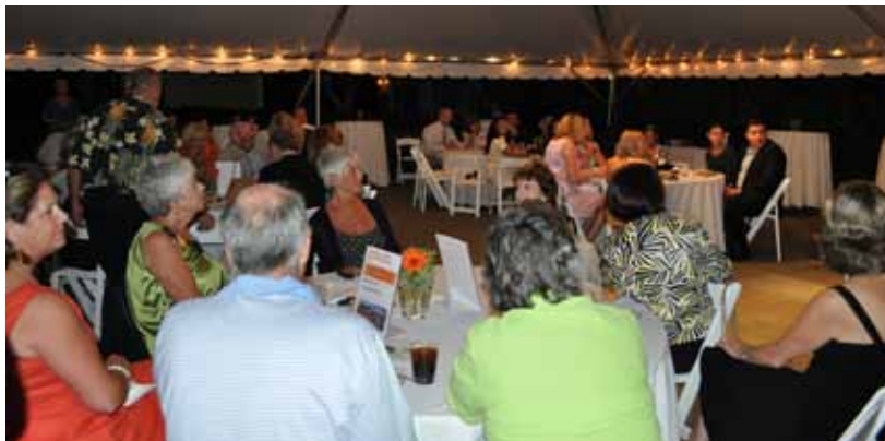
Aug 10: Under One Roof Event